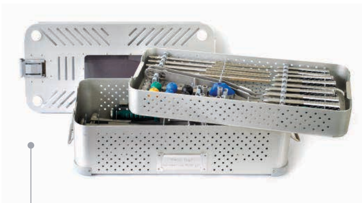
Instrumental para Vástagos MP-TP / MF / ACP